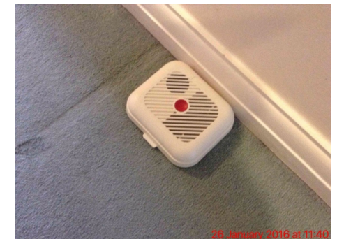
Photo 016 Sitting room - Ceiling