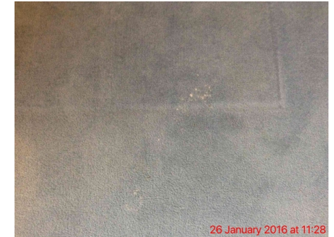
Photo 012 Bedroom 1 - Flooring