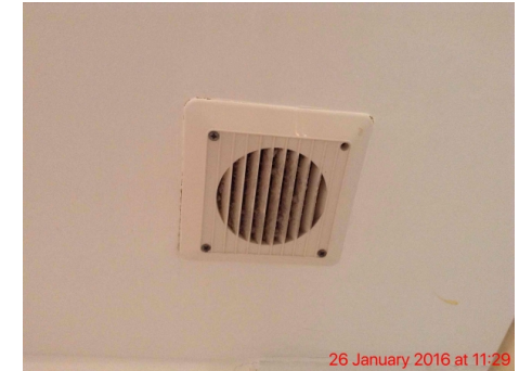
Photo 004 Bathroom - Bathroom Additional items