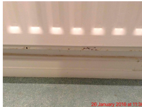
Photo 018 Bathroom - Heating