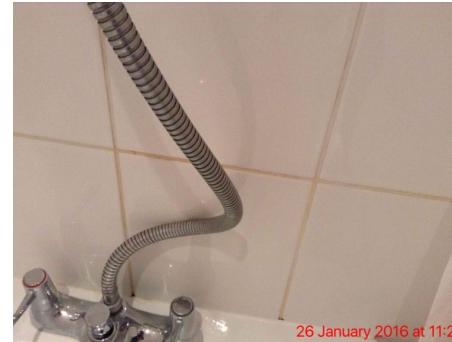
Photo 003 Bathroom - Walls