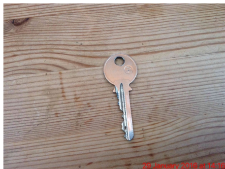
Photo 021 Keys Photograph - Photograph