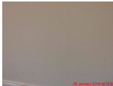
Photo 006 Bedroom 1 - Walls