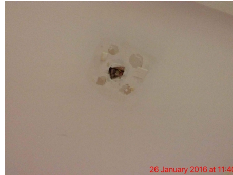
Photo 010 Sitting room - Ceiling