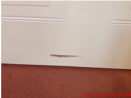
Photo 009 Bedroom 2 - Door