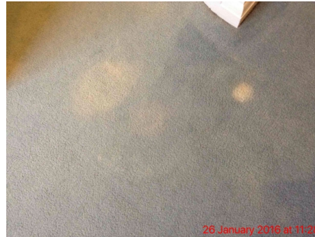
Photo 002 Bedroom 1 - Flooring