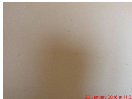
Photo 014 Bedroom 1 - Walls