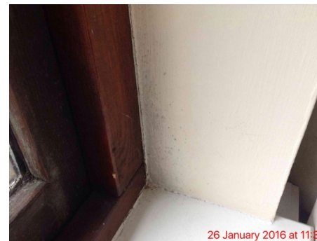
Photo 007 Bedroom 2 - Walls