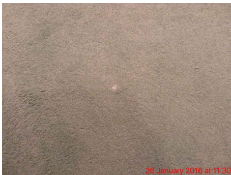
Photo 005 Bathroom - Flooring