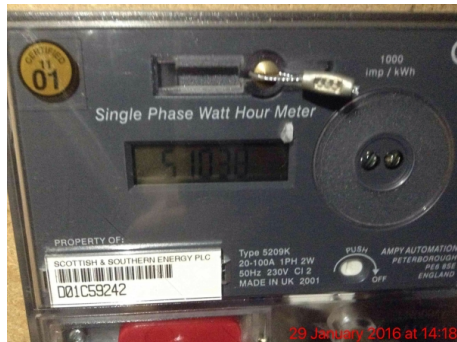
Photo 017 Electric meter photo - Photograph