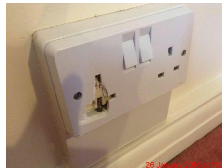
Photo 015 Bedroom 2 - Sockets