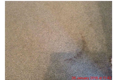
Photo 020 Sitting room - Flooring