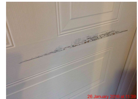
Photo 008 Bedroom 2 - Door