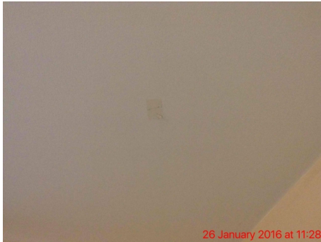
Photo 001 Bedroom 1 - Ceiling