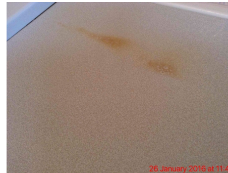
Photo 019 Kitchen - Kitchen Worktop