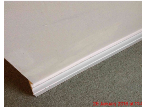
Photo 011 Sitting room - Walls