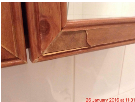
Photo 013 Bathroom - Bathroom Additional items