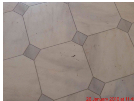
Photo 022 Kitchen - Flooring